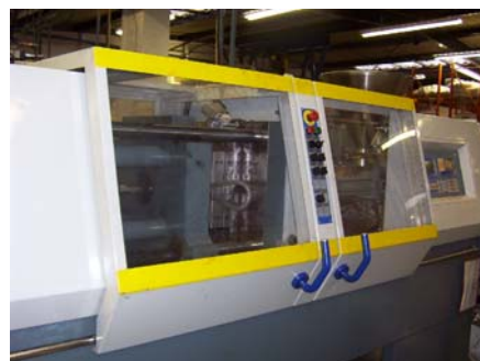
CNC Injection Moulding Machine

Tel: 01355 229985 e-mail: info@ekgta.com