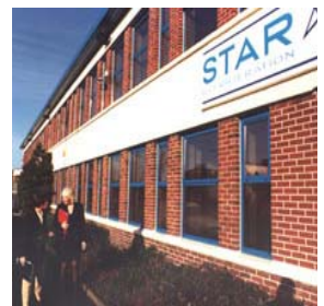
Star Refrigeration - Thornliebank