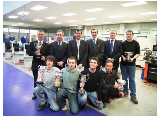
Prize Winners and guests 2006