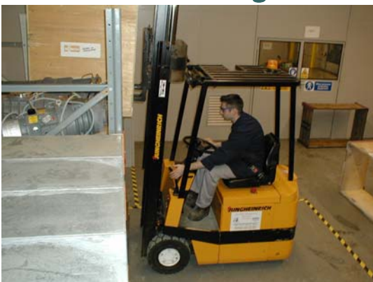
Forklift Training at Busch Semiconductors

In response to our clients needs EKGTA now offers a wide range of courses providing Forklift training for operators and managers.