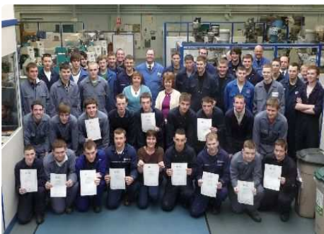
EKGTA 2009 cohort with their certificates

The importance of Health and Safety training can sometimes be underestimated, but we at EKGTA see it as the foundation to all types and forms of training delivered by our staff. During the induction which is delivered to new staff and trainees, a comprehensive programme has been developed to deliver the underpinning knowledge to participate, work and maintain a healthy and safe environment. Being able to test that this knowledge has not only been imparted but is also able to be "lived out" is vital to the success of the Association.