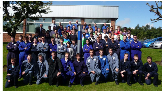
August 2009 Intake

Modern Apprenticeships are nationally recognised training pathways designed to attract bright, able young people to industry and provide them with the high level of work based skills required by many employers and with a wide range of available qualifications.