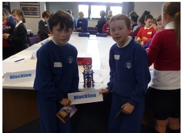
Blacklaw Primary 2010 K'nex Challenge Winners

The Junior Engineer for Britain K'NEX Challenge has a long and established history with thousands of pupils taking part each year. Following a series of regional finals, a National Final will be held in June 2010 and it is expected that over 30 teams will be invited to attend.